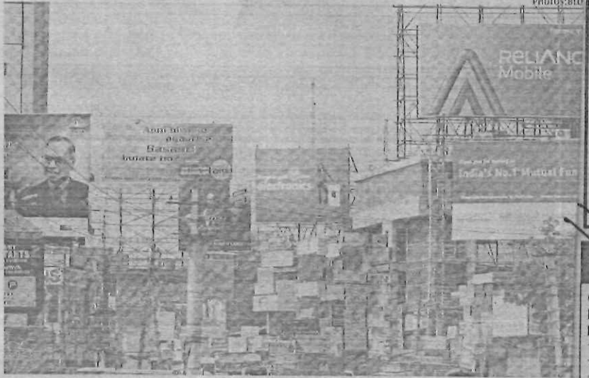
Outdoor advertising grew by 14 per cent in 2015 and is expected to grow by 13 per cent in 2016

A band of start-ups is using technology to change the rules of advertising, opening up the market for brands in Tier II